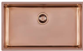
Sink KE Copper 2157 858